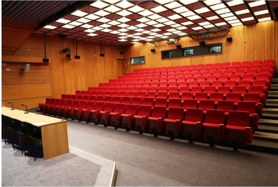
Lecture hall; 5th floor in the main building.