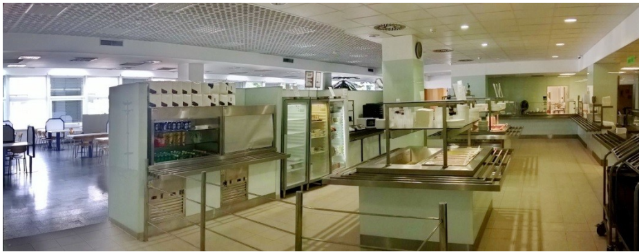
Cafeteria where both lunches will be served; +1 st floor of the main building.