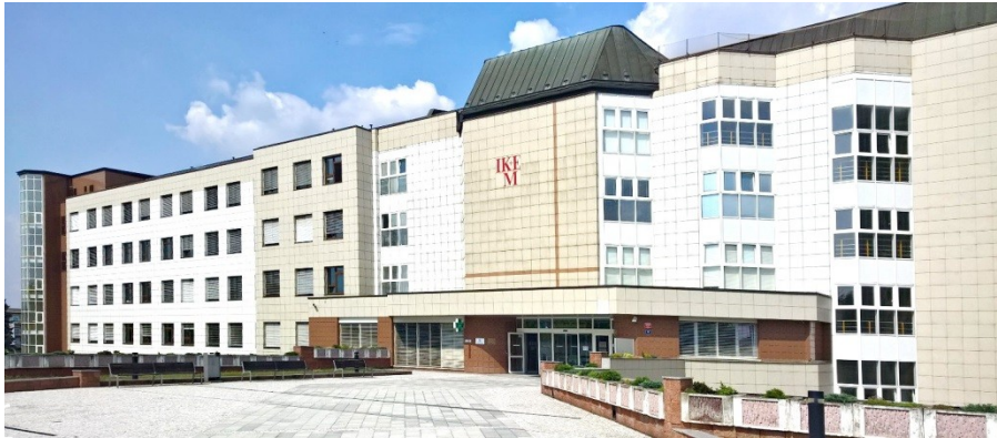
Main entrance to the Institute (IKEM), Vídeňská 1958/9; +2 nd floor of the building.